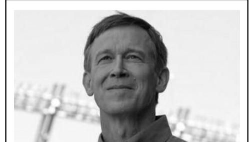
Governor John Hickenlooper